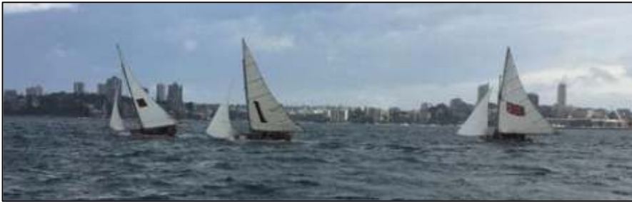
Britannia, Aberdare (with Top Weight's mainsail) and Australia IV approach the start.

The race got underway from a delayed scratch start in Athol Bight on the no.4 Sth course into a puffy 12 -15 kt SSW breeze, at the end of the run-out tide. Other sailing/boating activity on the harbour was somewhat reduced following the thunderstorm giving the skiffs a clear course on the first beat up to Clark Island. The Mistake carried full size no.2 rig, Britannia had a reef in the no.2 mainsail, Aberdare had a reef in a borrowed big mainsail off Top Weight, and Australia IV had a no.1 mainsail with no.2 jib. The Mistake made a good start at the boat end with Britannia, Aberdare and Australia IV close at hand while Tangalooma was delayed in clearing Careening Cove and missed their start. Scot launched and headed out from Careening Cove but rig issues forced them to retire back to the club.