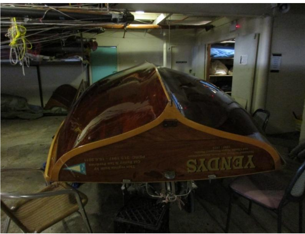
Yendys will be sleek and slippery through the water with five coats of varnish. Looking fabulous.